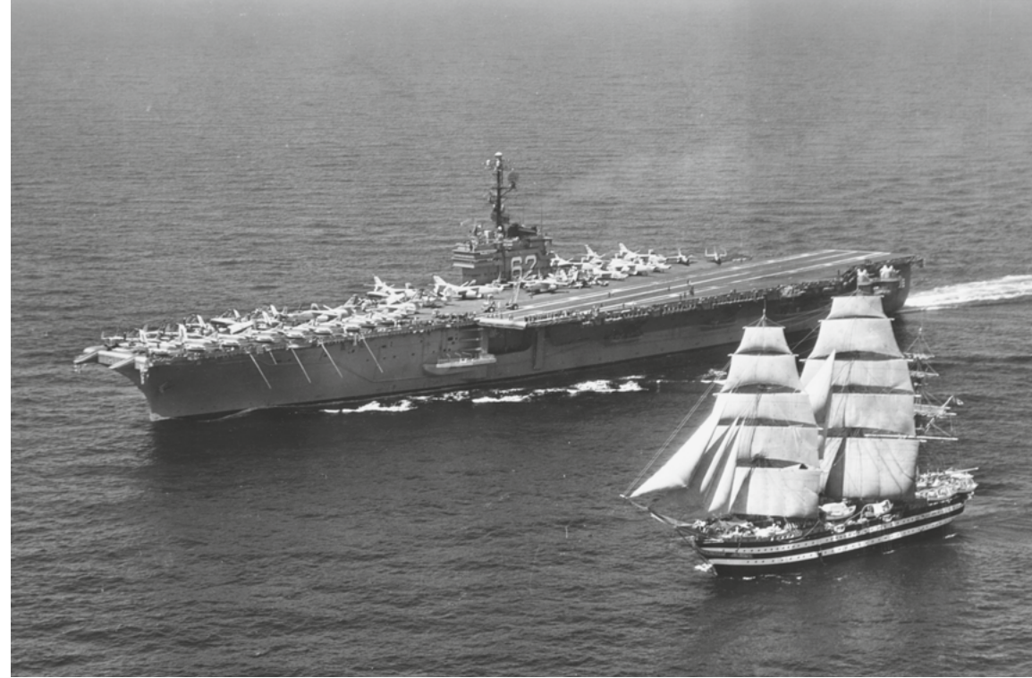
The American aircraft carrier USS Independence and Training ship Amerigo Vespucci , Italian Navy (1962, July 12 th ).

The Conference starts on the 28th March 2018 at 11.00 am and ends on the 31th March at 4.30 pm. Checkin and Registration: from 10:00 am to 10:50 am. Participants are expected to attend the whole programme of the conference, which is residential.